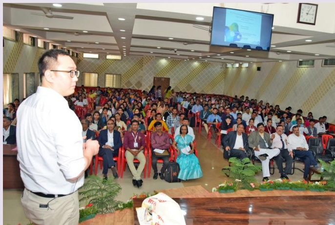
International Conference on Multifunctional and Hybrid Materials for Energy and Environment (29/01/2020 to 31/01/2020)