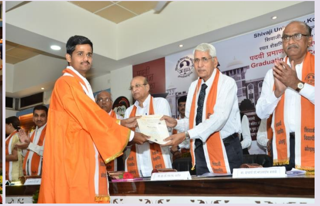
Graduation Day Ceremony (05/03/2020)