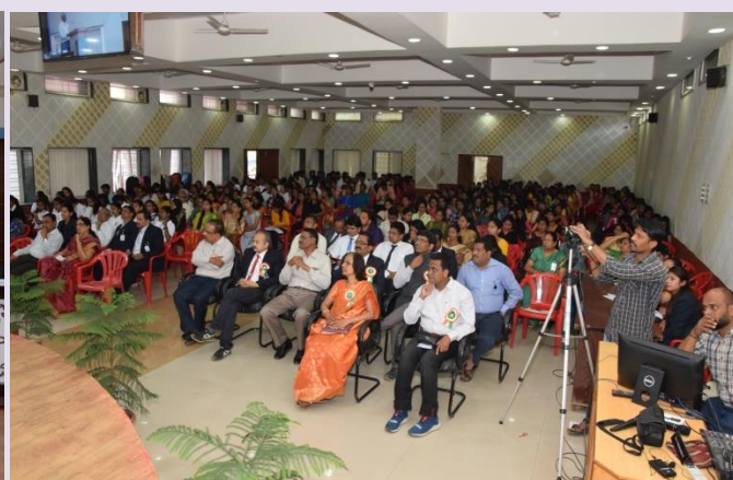
National Conference on Interdisciplinary Approaches in Life Sciences (02/02/2020 to 03/02/2020)